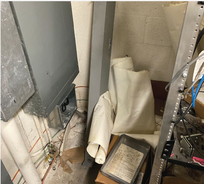
Figure 7. Blocked Electrical Panel

Source: OIG photo taken February 2, 2023.