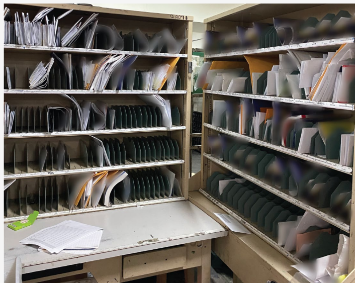
Figure 1. Delayed Mail at the Flagler Station