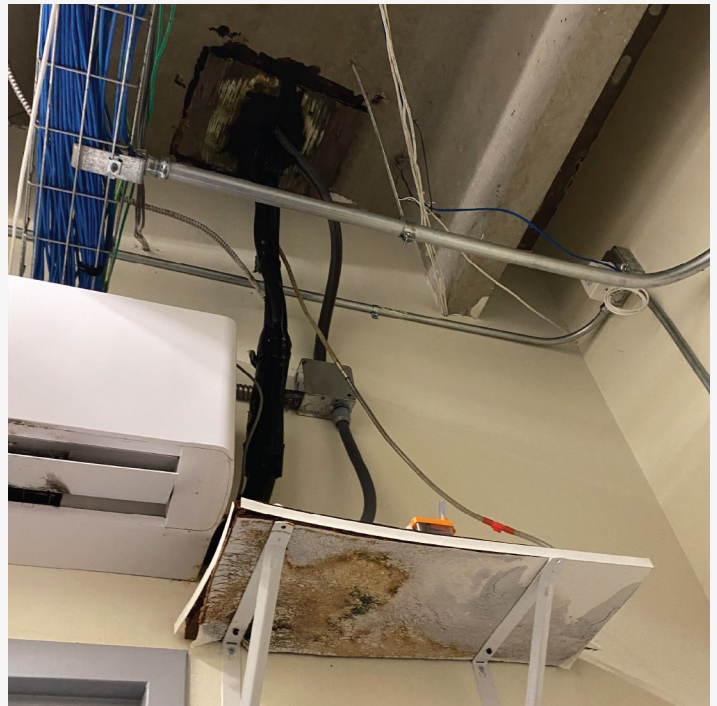
Figure 5. Leak in Electronics Room