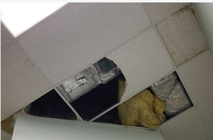
Figure 8. Damaged and Stained Ceiling Tiles