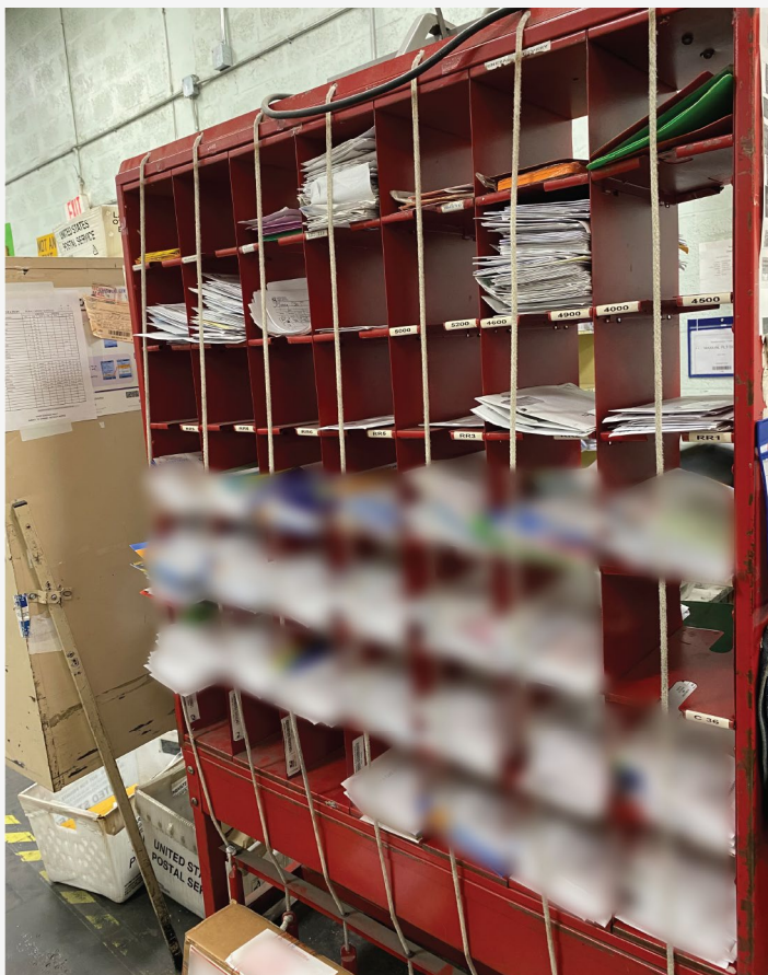
Figure 2. Delayed Mail at Princeton Branch