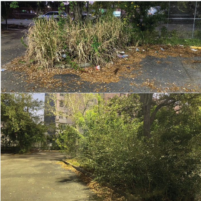
Figure 4. Overgrown Landscaping in Employee Parking Lot