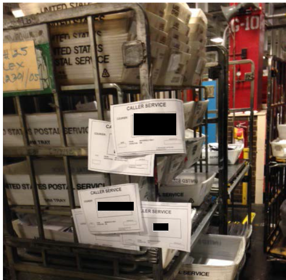
taken November 17, 2015.