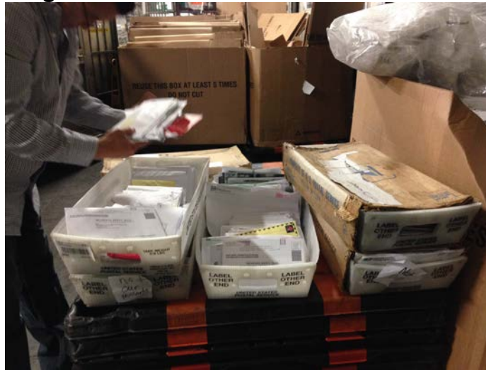
Figure 5. Courier Returns Misdirected Mail