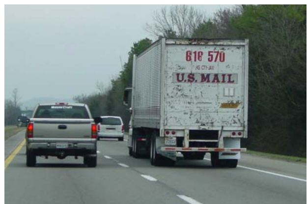
PVS cargo van transporting mail from a mail processing facility to the historic Memphis Post Office, February 12, 2007.