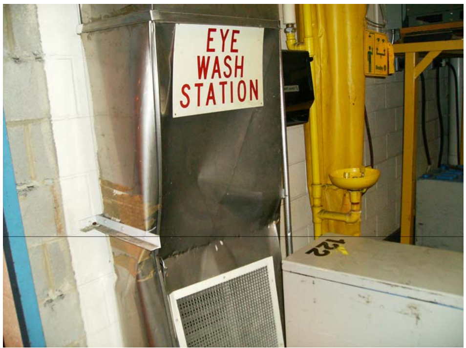
Illustration 2: On April 28, 2008, at 2:08 p.m., we observed damage to a duct and wall in the Raleigh P&DC, caused by a vehicle impact.

On several occasions, management used the PIVMS to identify the employee logged on to a vehicle when an accident occurred. During our review at the Raleigh P&DC, we did not observe unsafe driving practices or accidents. However, we observed that vehicle impacts had caused damage to the building and to PIVs. See Illustrations 2 and 3 below.