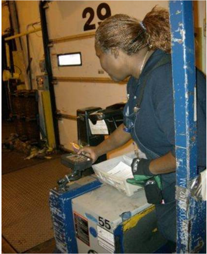
Illustration 1: Employee used proper identification and the OSHA checklist to start the tram on May 1, 2008, at 10:42 a.m.