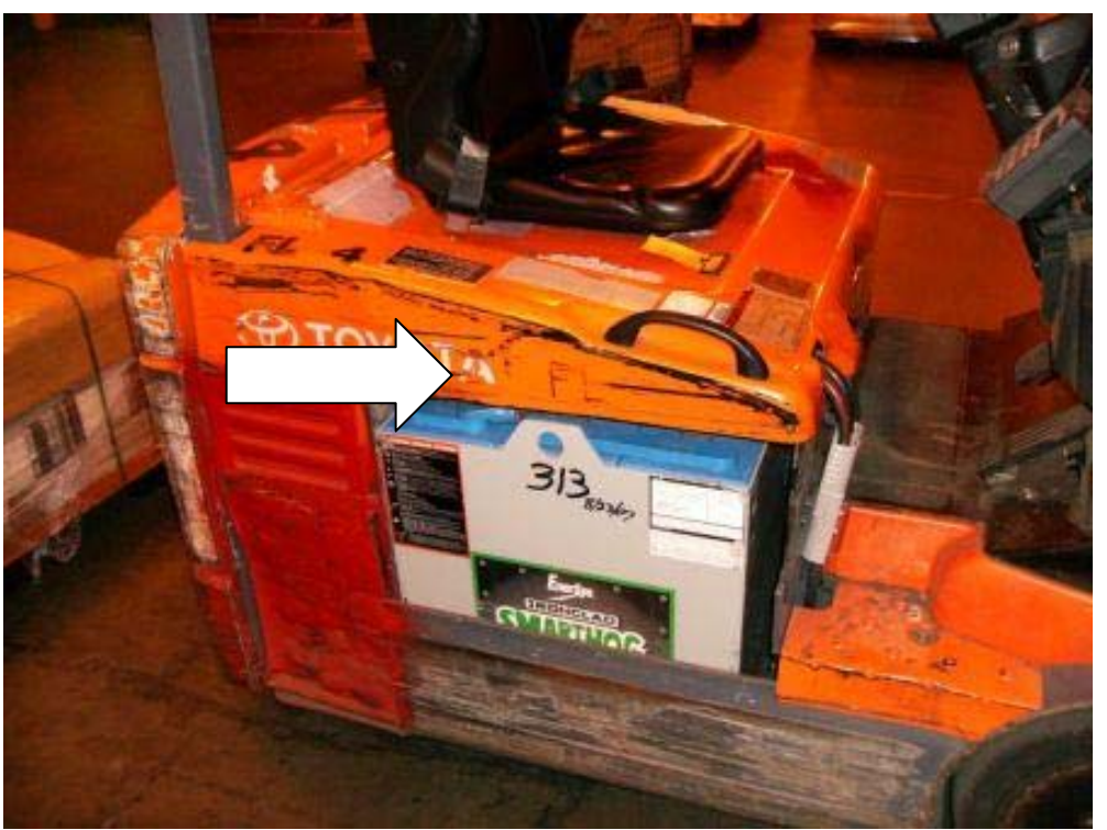
Illustration 3: On April 28, 2008, at 2:20 p.m., we observed a damaged forklift. The side cover was torn.

We also found that management did not run or review OSHA compliance and other compliance exception reports from the PIVMS. These reports allow management to track and monitor whether the PIVMS is complying with OSHA, correct noncompliance, and report OSHA issues to higher management.