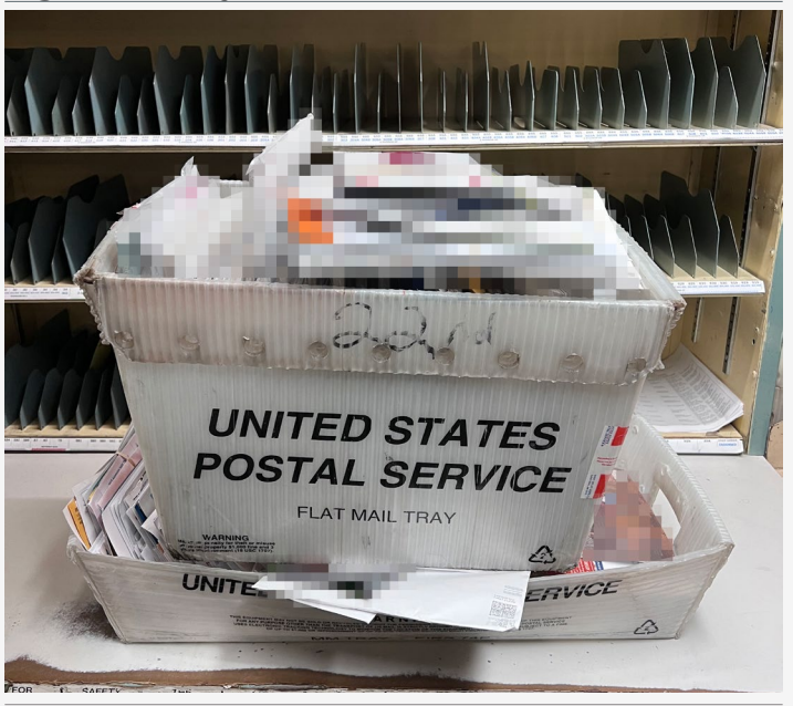
Figure 1. Delayed Mail at the Carrier Case

manager did not monitor that the delayed mail counts in DCV were accurate.