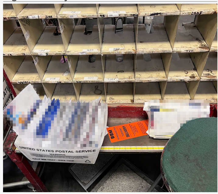
Figure 2. Delayed Mail on Workroom Floor